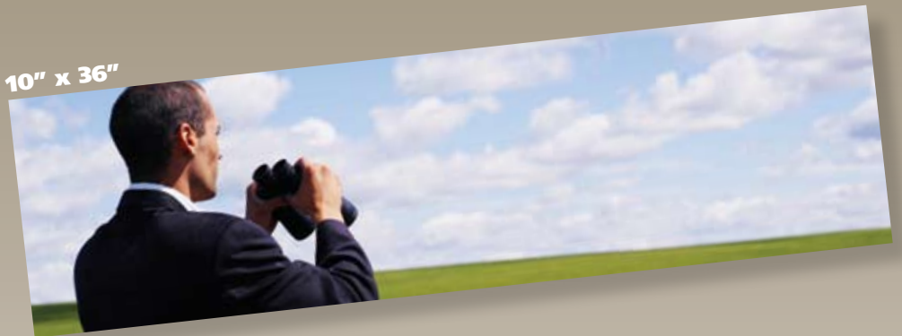
10" x 36"