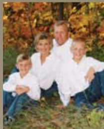
8" x 10"